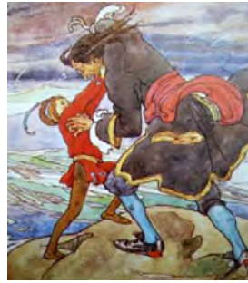
Peter Pan by J M Barrie, Illustrator Alice B Woodward