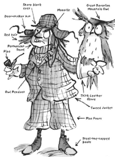
Awful Auntie.- Illustrator Tony Ross