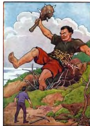
Jack and the Beanstalk. Mother Goose Tales