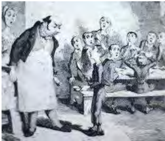
Oliver Twist asks for more