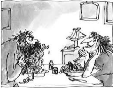
The Twits By Roald Dahl, Illustrator Quentin Blake