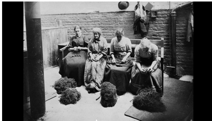
Workhouse women picking oakum

Soot tells Stella how he was abandoned as a baby and grew up in a workhouse. This was the fate of many poor people in Victorian times, adults as well as children. Introduced in 1834, the workhouse provided a place to live, a place to work and earn money, food, clothing, free medical care (people had to pay to see doctors in Victorian times) and education. They were huge buildings providing everything onsite – dormitories, kitchens, dining hall, laundry, school rooms, nurseries, a sick bay, chapel as well as a vegetable garden and often a small farm. But workhouses were feared. The conditions and harsh regimes made life inside was similar to that in a prison. Men, women and children had different living and working areas so families were split up. Often they were punished if they even tried to speak to one another. The work was hard: for example ‘picking oakum’, which involved untwisting the strands of old ropes and unrolling the individual strands so they could be used again.