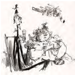
James and the Giant Peach

By Roald Dahl, illustrator Quentin Blake