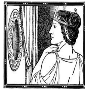
Snow White by The Brothers Grimm Illustrator Joseph Jacobs