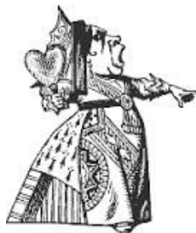
Alice in Wonderland By Lewis Carroll